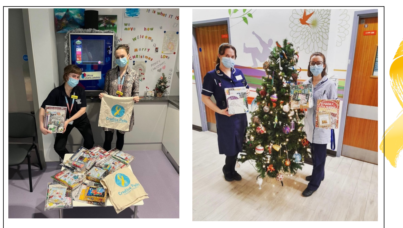
Photos from the staff at UCLH, London, and The Royal Marsden, Sutton